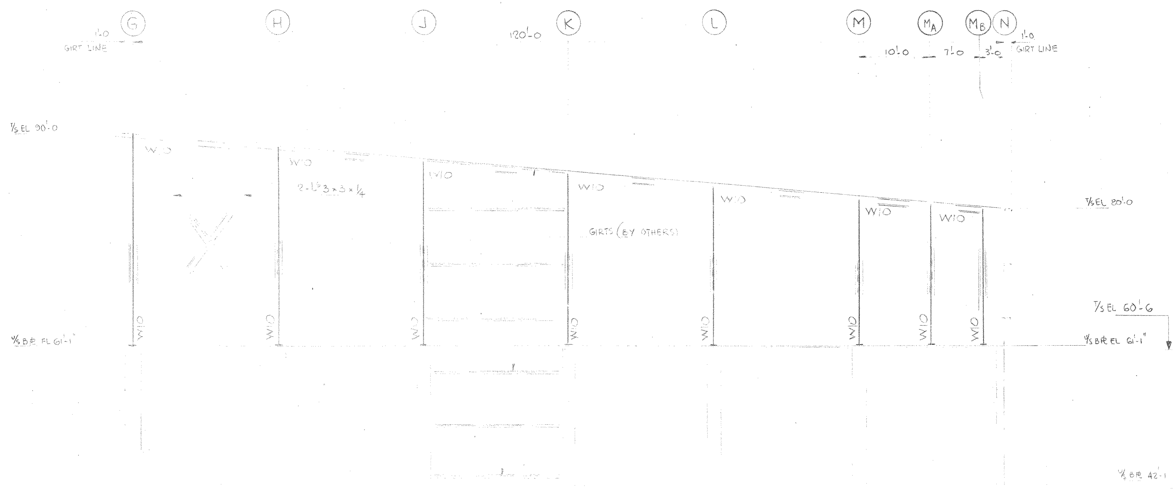
ELEVATION ALONG COLUMN LINE 1