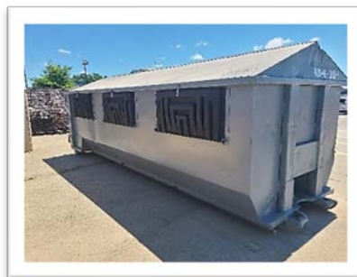
Current vendor bin at Shady Grove