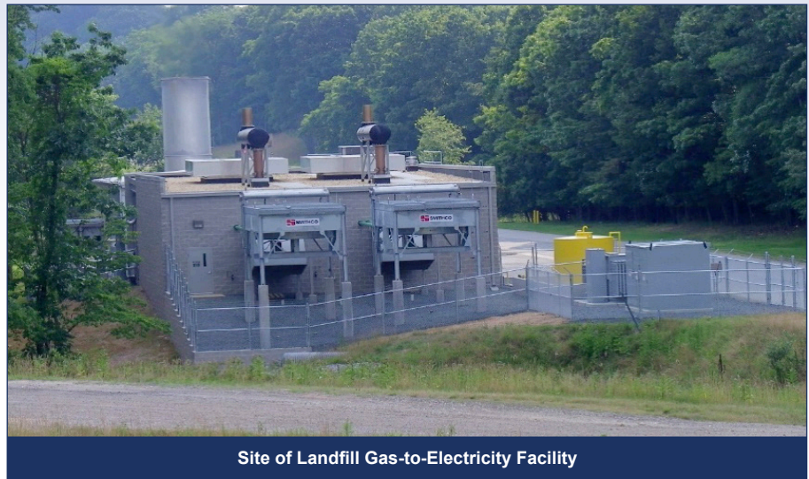
Site of Landfill Gas-to-Electricity Facility

The gas-to-electricity project was developed through a partnership between Anne Arundel County, the Northeast Maryland Waste Disposal Authority, and LES Operations