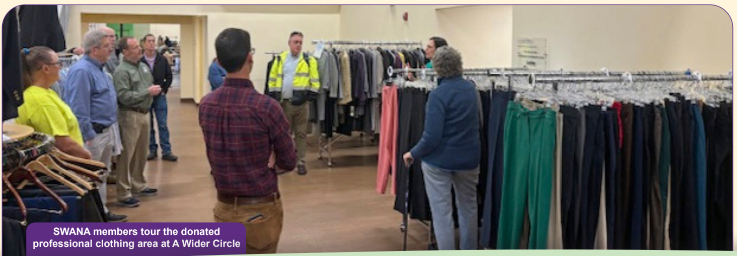
SWANA members tour the donated professional clothing area at A Wider Circle