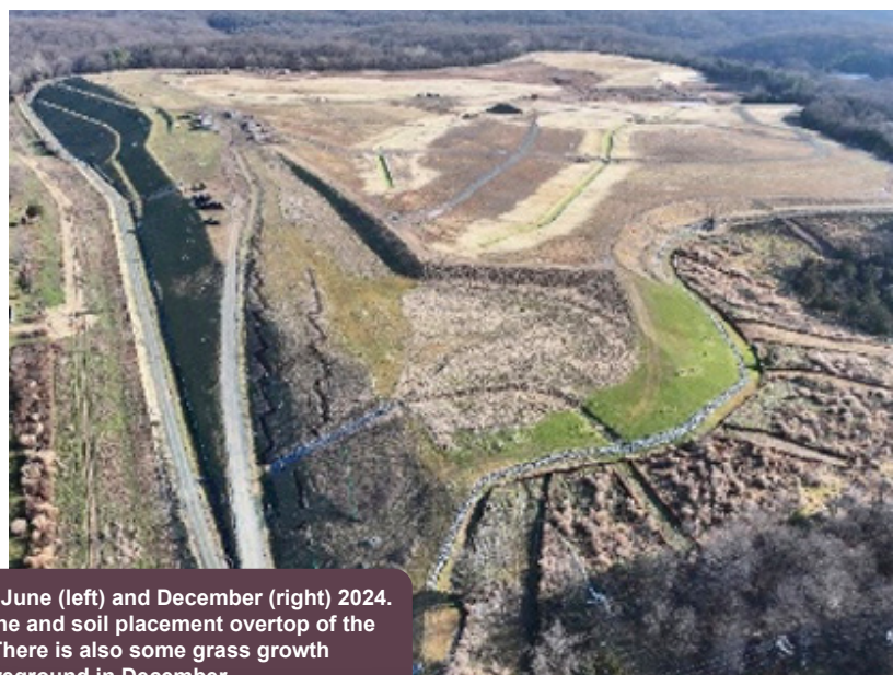
A side-by-side of the GUDE site from June (left) and December (right) 2024. Exposed liners are prominent in June and soil placement overtop of the liners is evident in December. There is also some grass growth on the slope in the foreground in December.