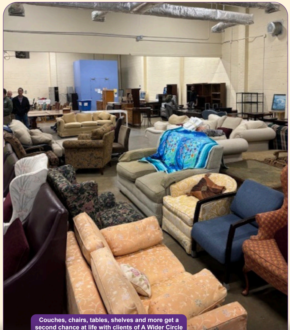
Couches, chairs, tables, shelves and more get a second chance at life with clients of A Wider Circle

To learn more about A Wider Circle, please visit their website ( A Wider Circle ).